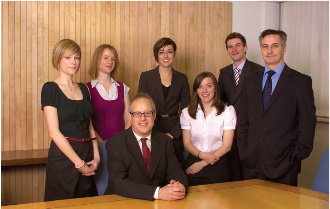
Members of the Public Law Team