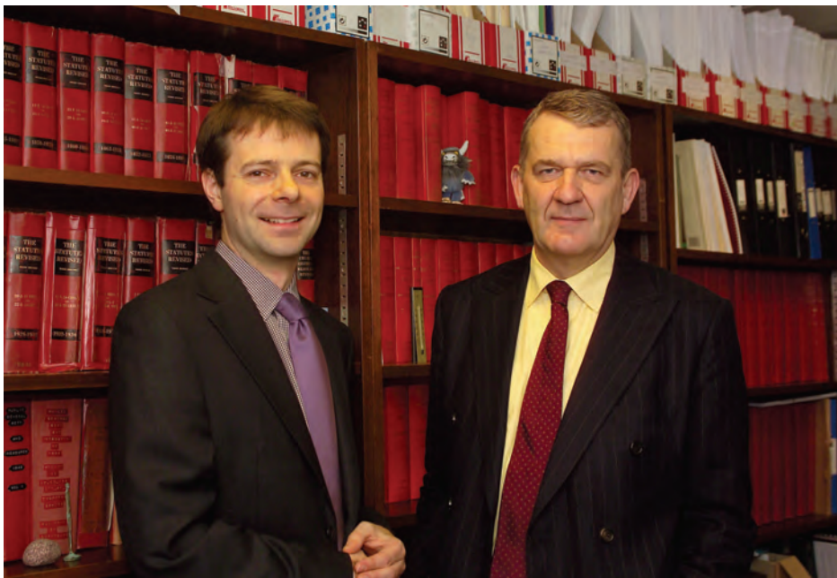
Members of the Parliamentary Drafting Team