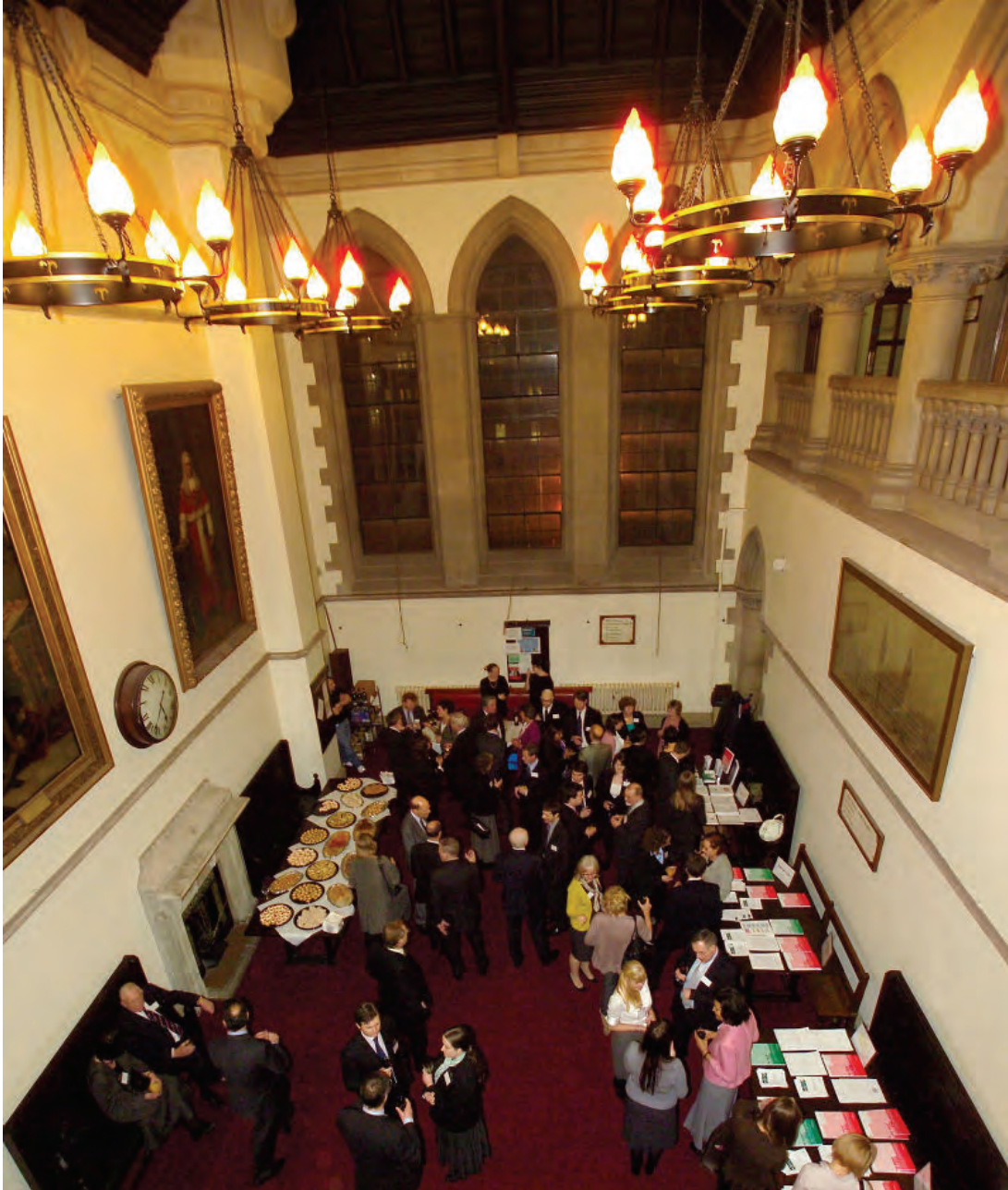
The Law Commission held a stakeholder event in the Royal Courts of Justice in January 2010