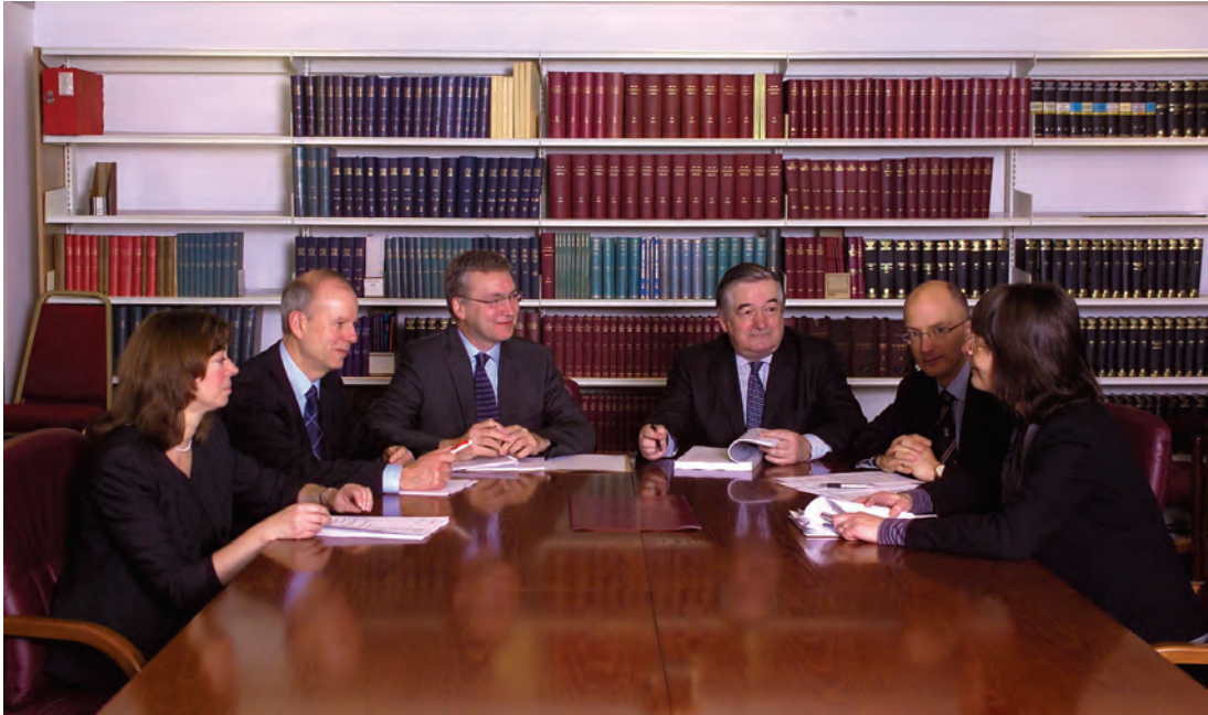
The Chairman, Commissioners and Chief Executive