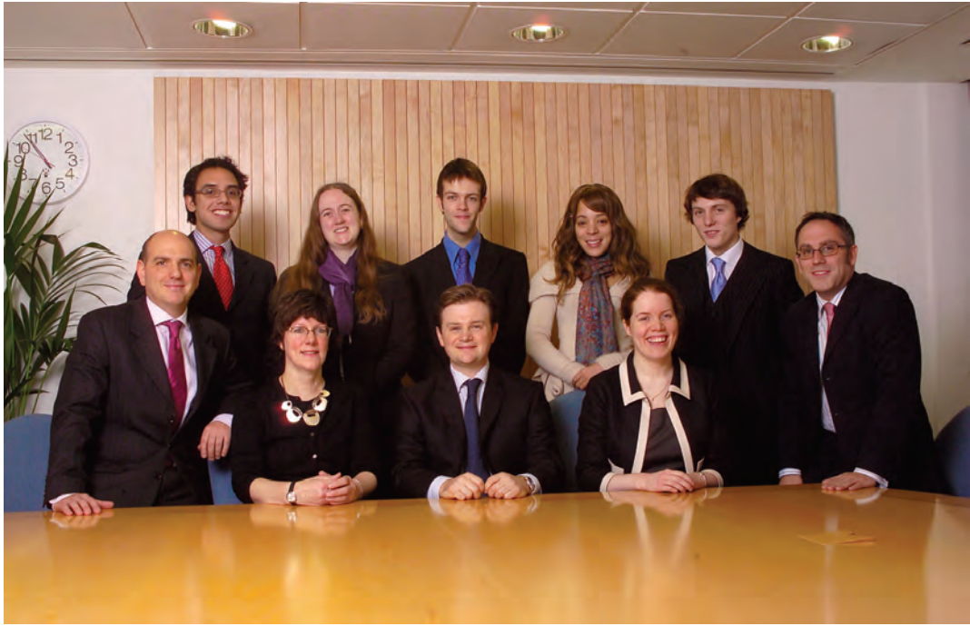
Members of the Property, Family and Trust Law Team