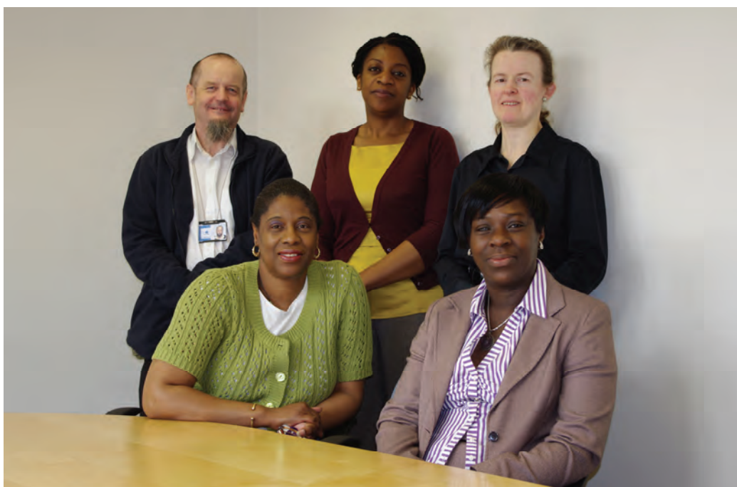
The Corporate Services Team and the Library Team