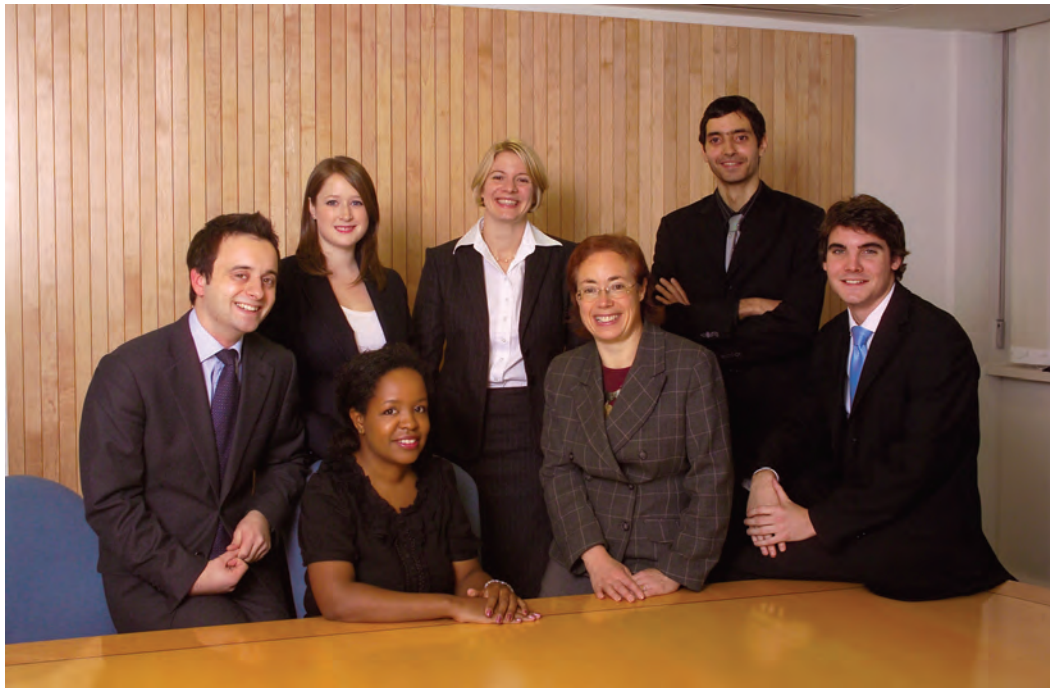
Members of the Commercial and Common Law Team