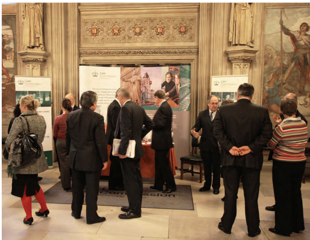
Visitors to the Law Commission's stand in the House of Commons