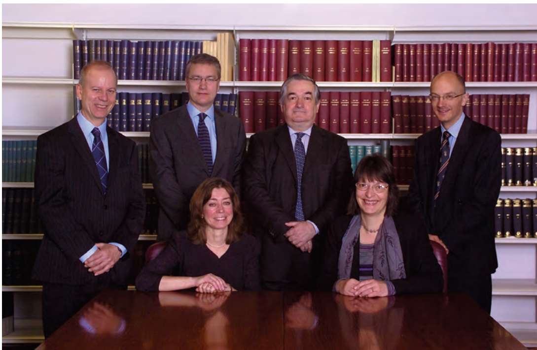
Chairman, Commissioners and Chief Executive

The Commission is located at Steel House, 11 Tothill Street, London, SW1H 9LJ.