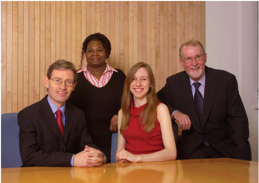
Members of the Statute Law Repeals Team