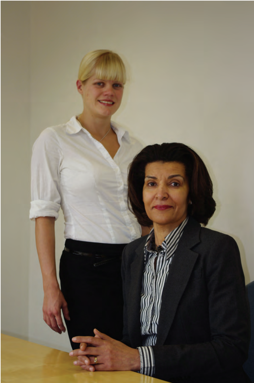
Members of the Economics Team