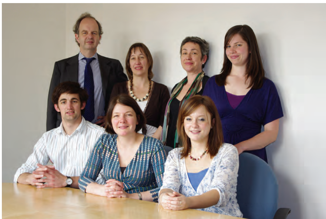
Members of the Criminal Law Team